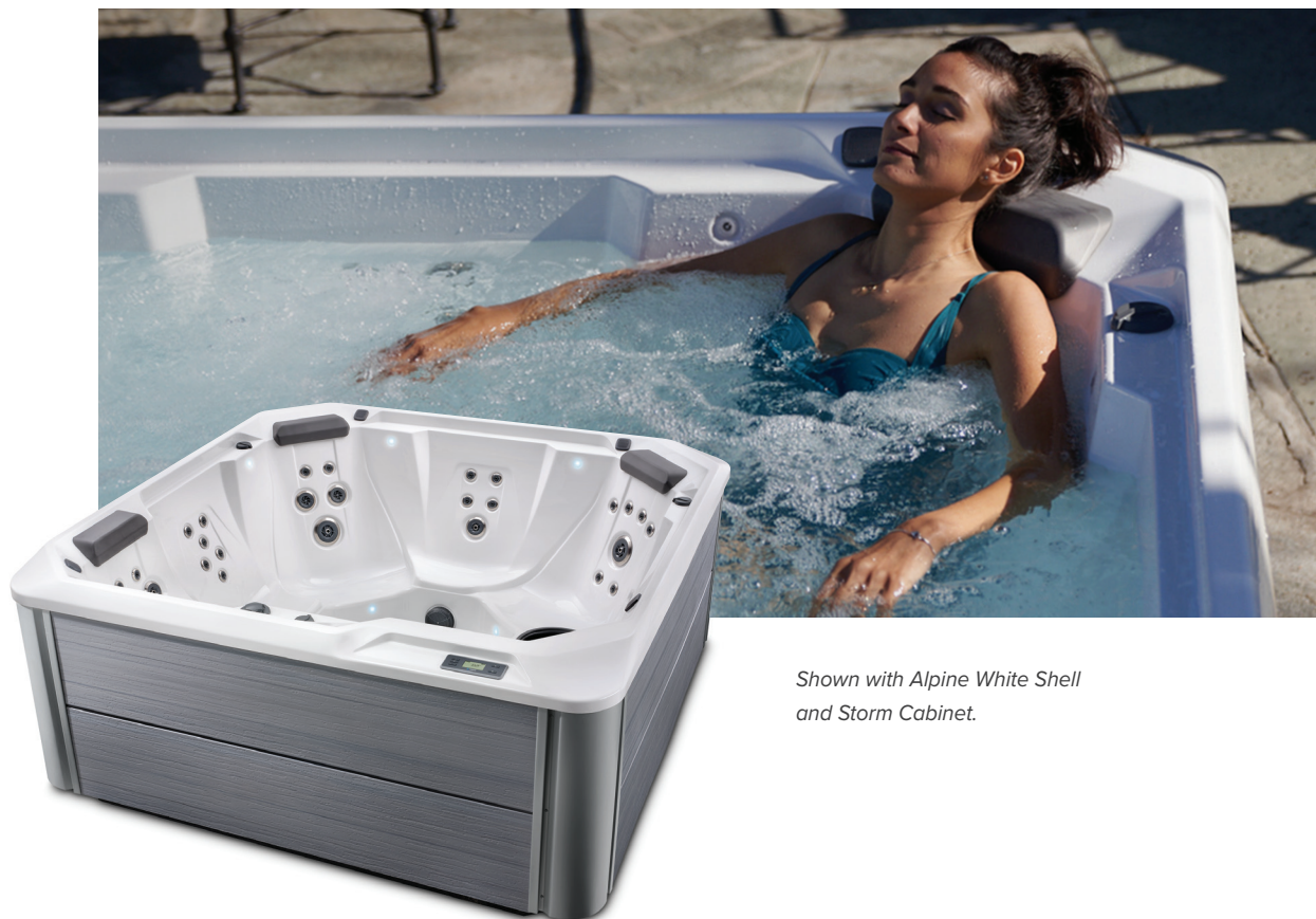
Shown with Alpine White Shell and Storm Cabinet.